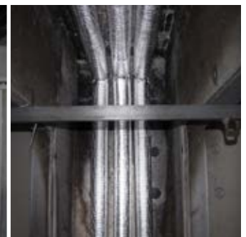
FM 4924 Fire Pipe test